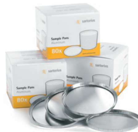
Disposable sample pans